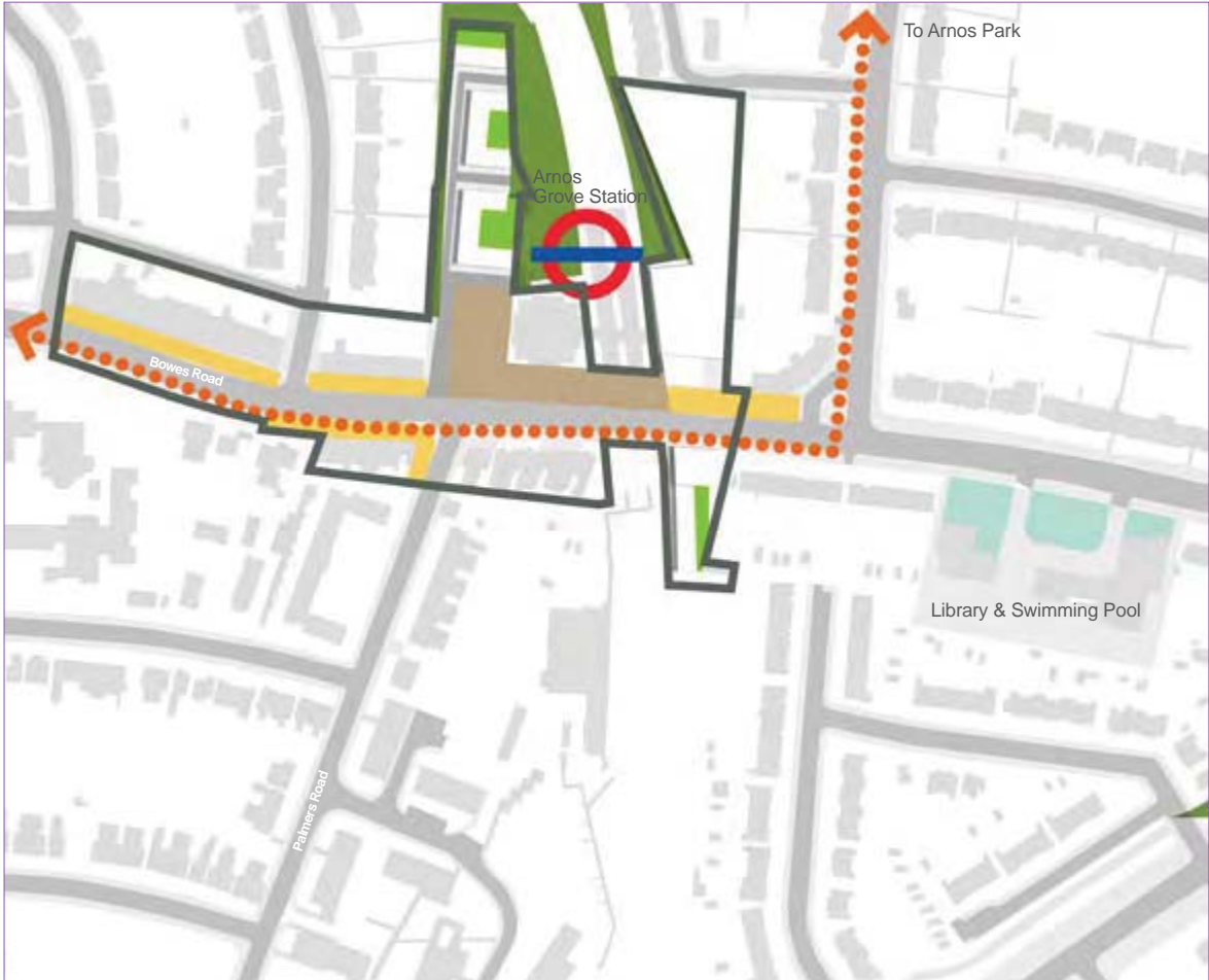
Figure 5.4.4 Public realm: Arnos Grove Local Centre and Arnos Grove Station This plan shows the ideas for streets and public spaces.