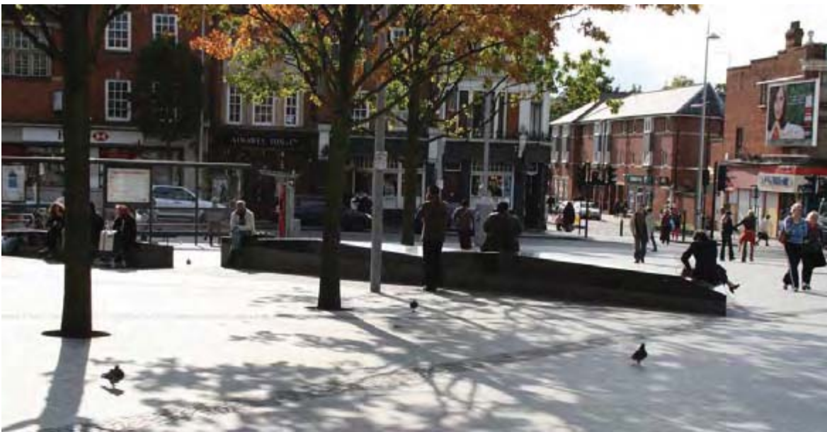
Examples of new public squares that could be suited to the station area