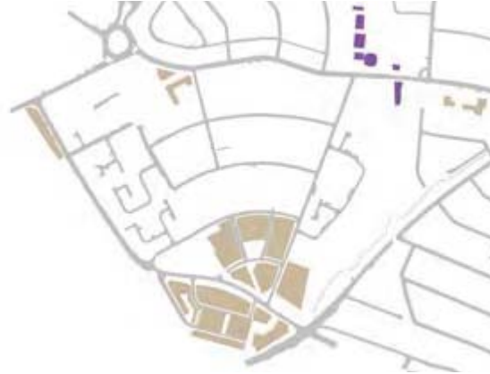
Regeneration Site 6 Arnos Grove Local Centre and Arnos Grove Station