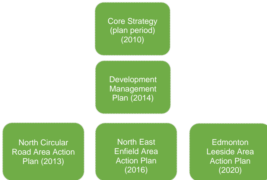
Figure 2.1: The current Enfield Development Plan

2.6 Enfield's Local Plan consists of several documents as set out in Figure 2.1.