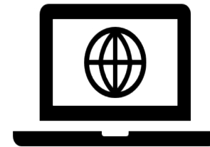
Various other online methods, such as mapping and forums