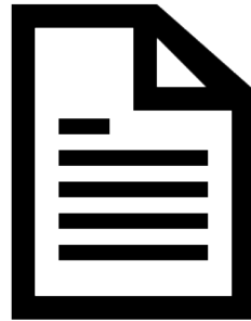
Questionnaires (including online)