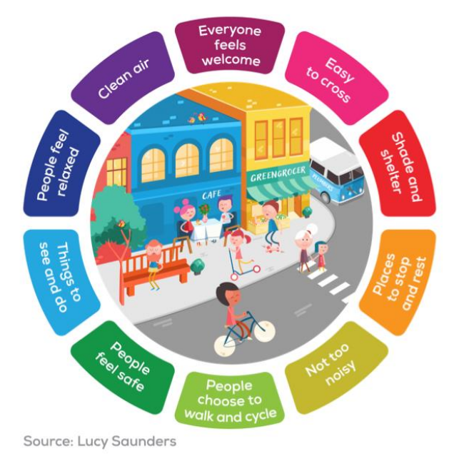
Figure 1: Healthy Streets Indicators

21. The Enfield Healthy Streets Framework was approved by Cabinet in June 2021. The report sets out the framework for developing and delivering Healthy Streets projects which incorporates the Healthy Streets Approach. The framework identifies activities to deliver on local, London and national policy objectives. Active travel improvements are identified and discussed in Activity 1 (creating a high-quality walking and cycling network) and Activity 2 (making streets safer, reducing road danger and the number of people killed or