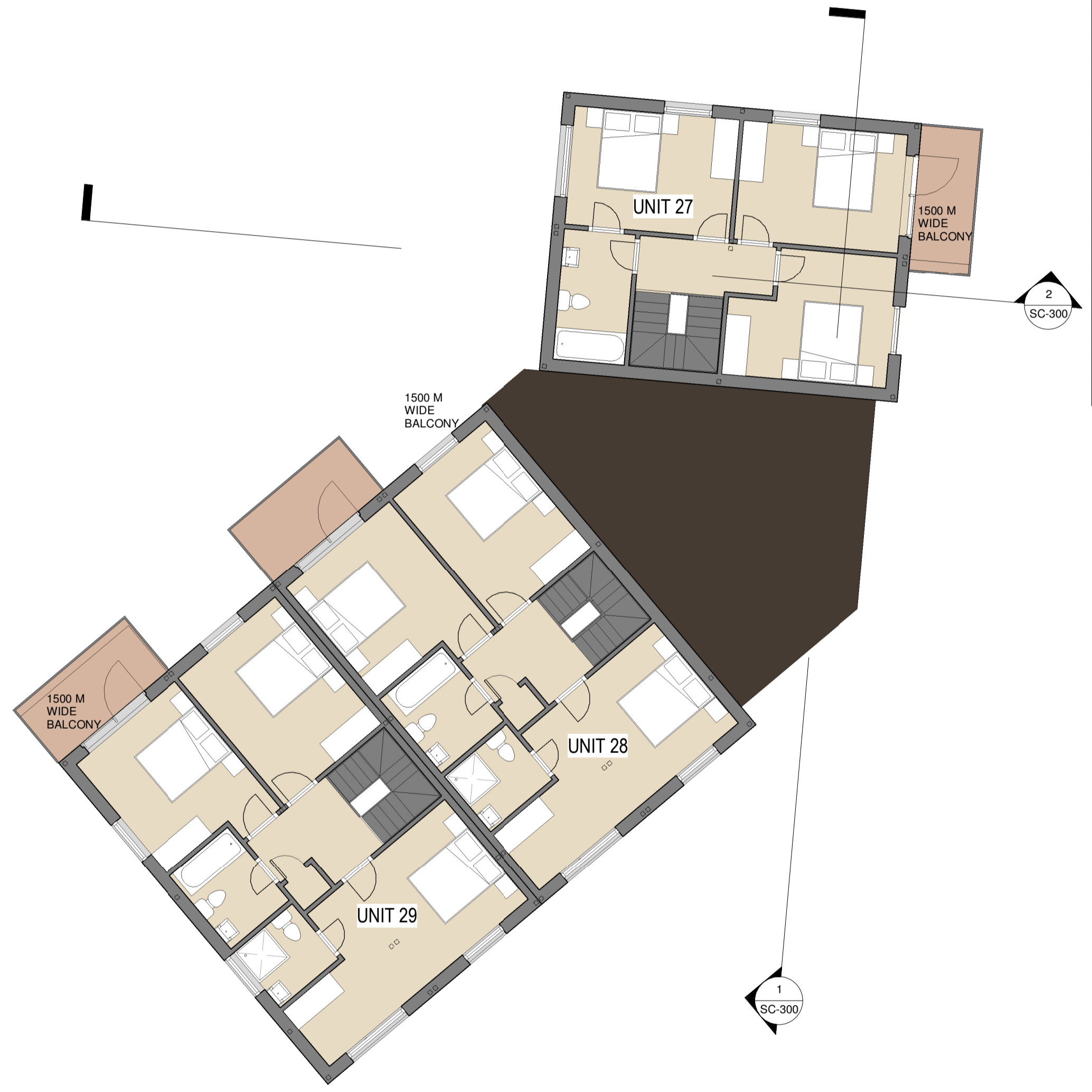
2 FIFTH FLOOR LEVEL 1 : 100